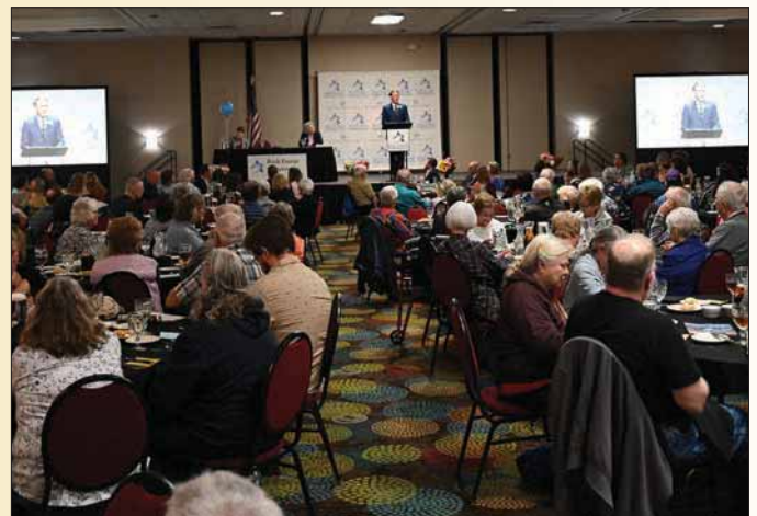
Pictured above, co-op members listen in during the CEO's address at the 2026 Rock Energy Annual Meeting.

Also announced during the scholarship presentation were second-year scholarship winners. Those students, going into their sophomore year of college next year, were not in attendance.