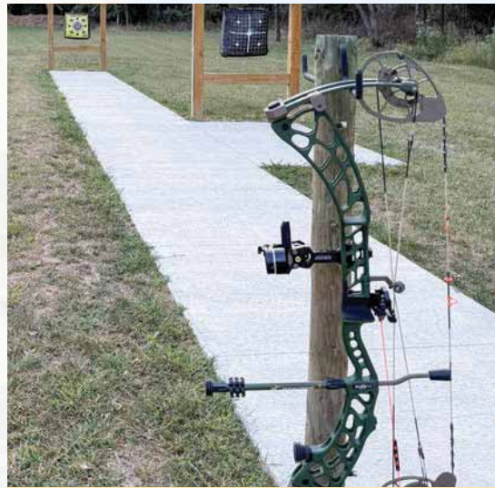
The archery park has practice lanes and bagged targets available.

Those interested in getting more involved at Lake Shelbyville can learn more about conservation efforts and volunteer opportunities by visiting the Backcountry Hunters and Anglers website at