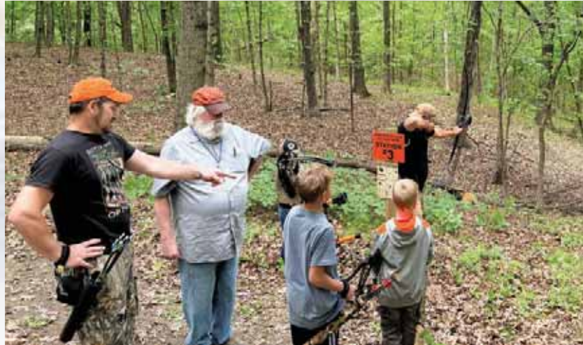
Community members of all ages participated in the Open Shoot kickoff event for the archery park in May 2025.

Visitors can choose from seven campgrounds offering more than