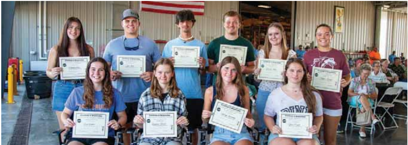
2025 Annual Meeting Scholarship Winners