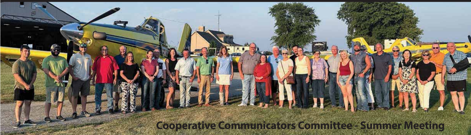
Cooperative Communicators Committee - Summer Meeting