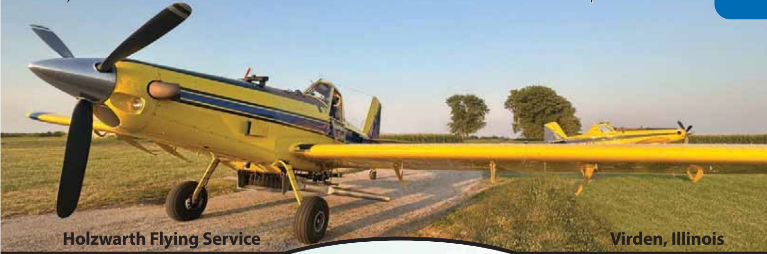
Holzwarth Flying Service