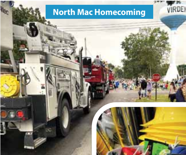
North Mac Homecoming