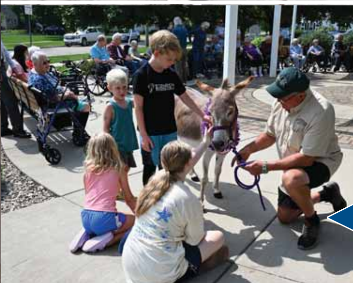
Pictured at left, Dream the donkey visits with a group of kids on hand at Skaalen nursing home.