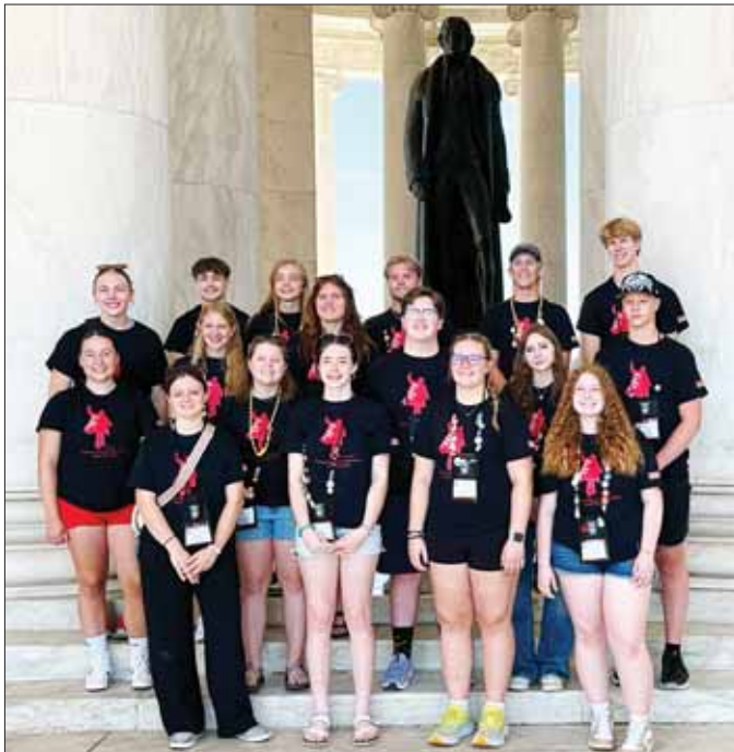
Pictured above, youth co-op members visit the Jefferson Memorial in Washington, D.C.