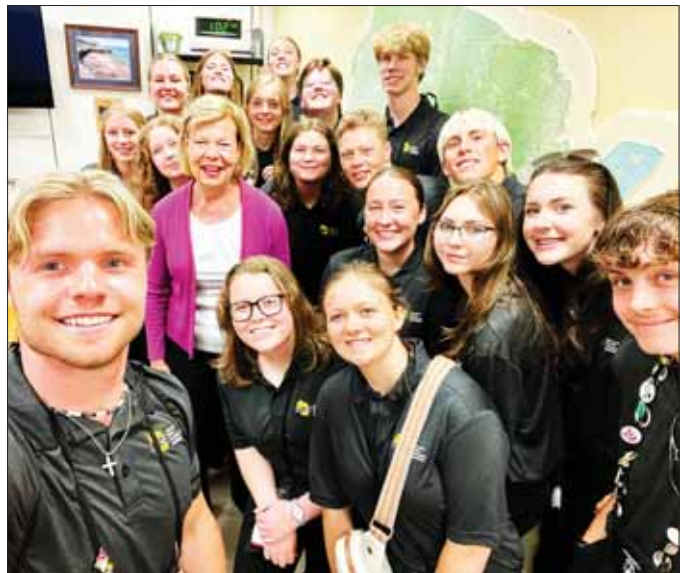
Pictured above, youth co-op members meet with legislative staff and legislators, including Senator Tammy Baldwin (D-Wisconsin) (wearing purple sweater), at the White House during the 2024 Youth Tour.