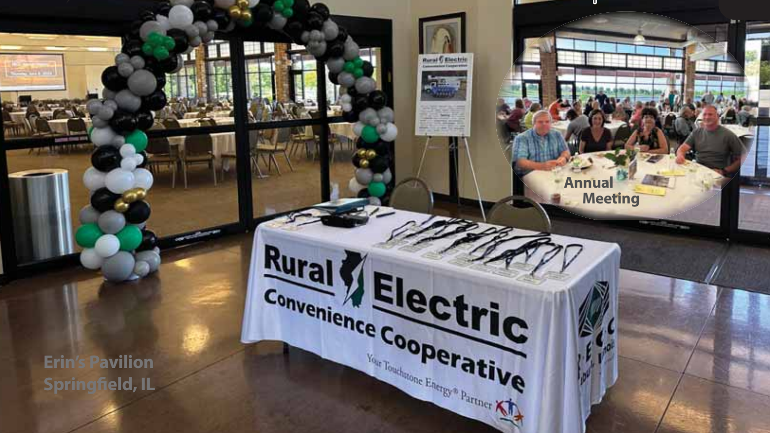
Erin's Pavilion Springfield, IL