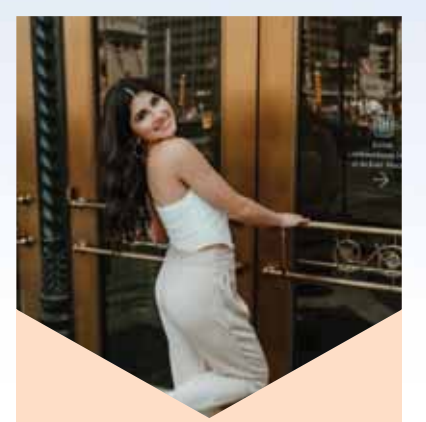
Fulton Fulton High School College: University of Iowa Planned course of study: Pre-Med