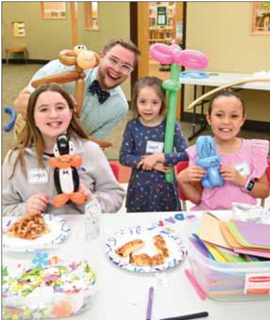
Pictured above, Rock Energy member youth enjoy pizza, games, and balloon art.