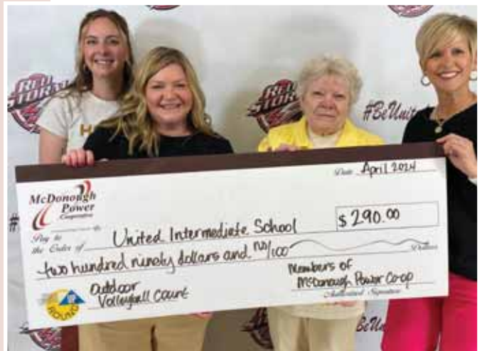
United Intermediate School received $290 for an outdoor volleyball court.

The next round of funding will occur in July, with applications due by July 1. For further details, click on Operation Round-Up at mcdonoughpower.com .