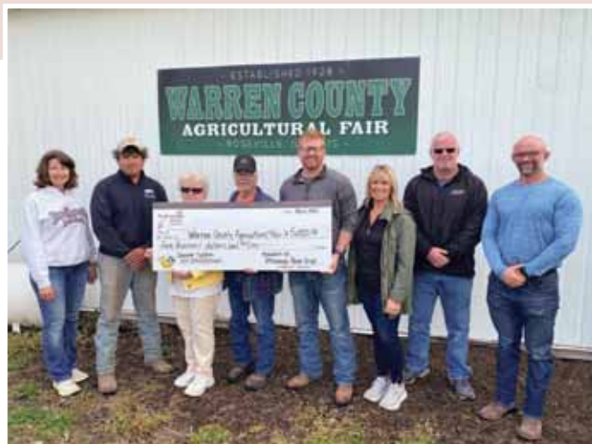
The Warren County Agricultural Fair received $5,000 towards the purchase of a speaker system for the grandstand.