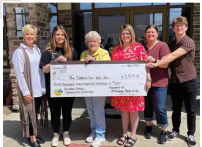
The Samaritan Well, Inc. will utilize $3,919.71 for their Resident Room Optimizations and Storage Project.