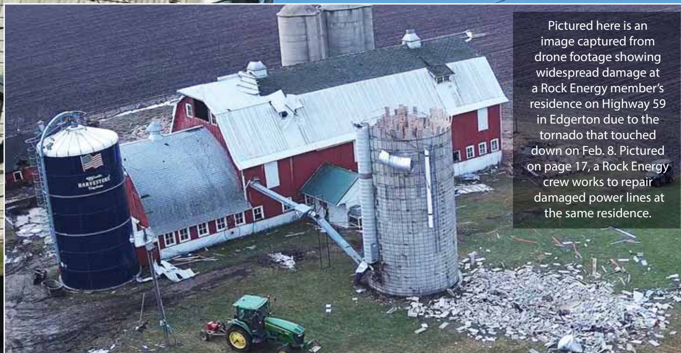
Pictured here is an image captured from drone footage showing widespread damage at a Rock Energy member's residence on Highway 59 in Edgerton due to the tornado that touched down on Feb. 8. Pictured on page 17, a Rock Energy crew works to repair damaged power lines at the same residence.

"We do everything we can to restore power as quickly as possible, but bad storms can make it difficult and sometimes it takes time to make large-scale repairs, such as we experienced with this tornado," said Tullar.