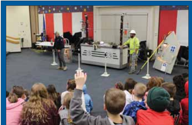
"Hot Line Demo" presented to students at Milton Northside.

2023 was a very busy and eventful year for Rock Energy Cooperative and its members! Here is a quick pictorial review of some of the events that took place in 2023.