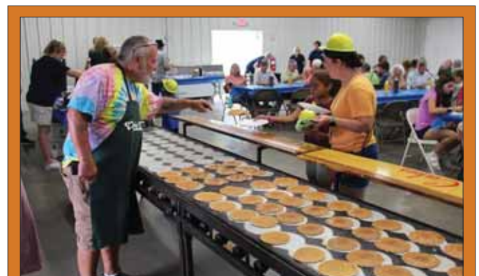
Pancake breakfast at Member Appreciation Day.