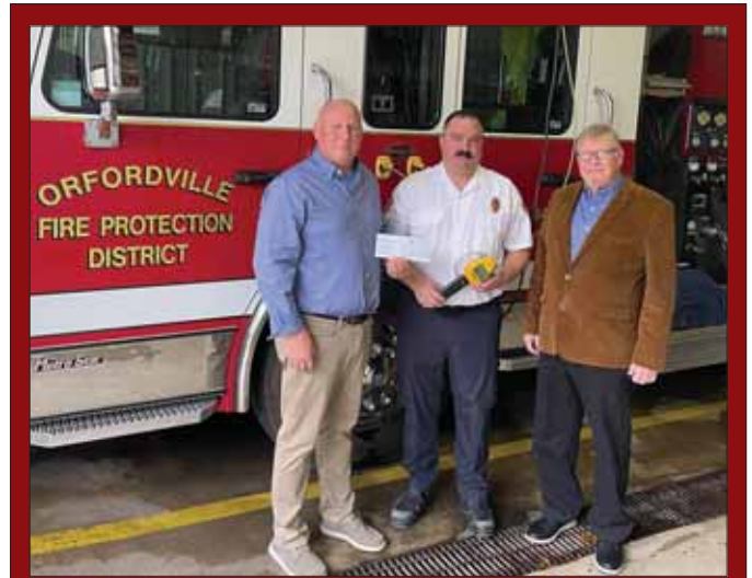
Safety Grant presented to Orfordville Fire Protection District.