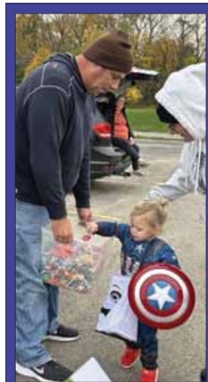
Trunk-or-Treat in South Beloit, IL