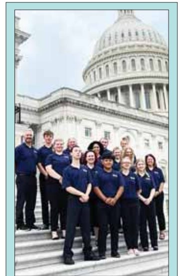
Youth Tour in Washington, D.C.