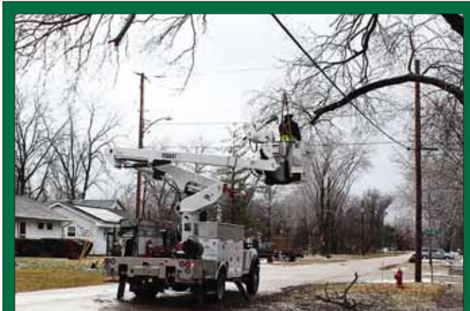
A major ice storm hits the area - Rock Energy crews respond.