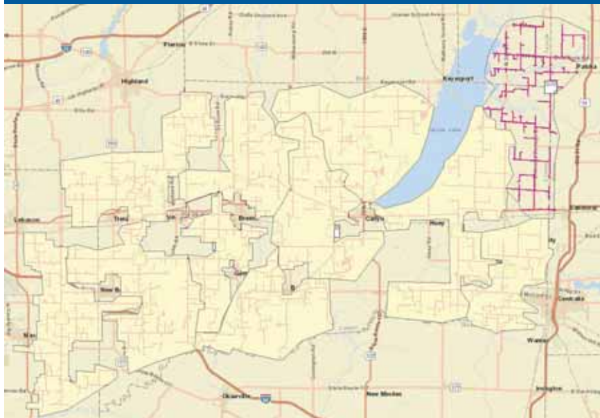
Poles will be treated in the areas served by the Boulder Substation.