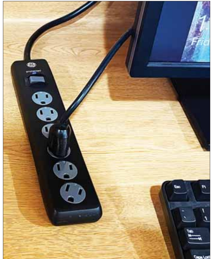
Using surge protector strips (above) can help keep your electronics from being damaged in the event of a power surge. Below is a ground fault circuit interrupter (GFCI), which helps to prevent electric shock and fire near sources of water.