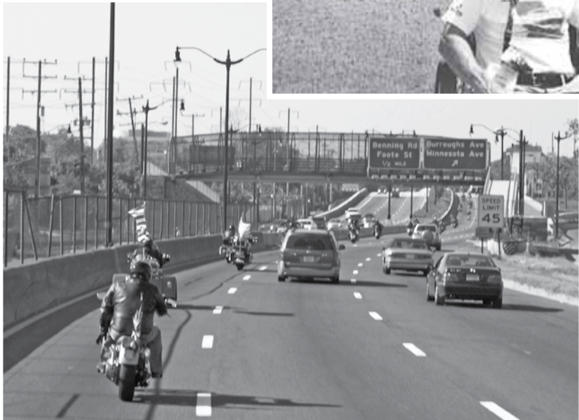
▲ Honor Flight motorcade