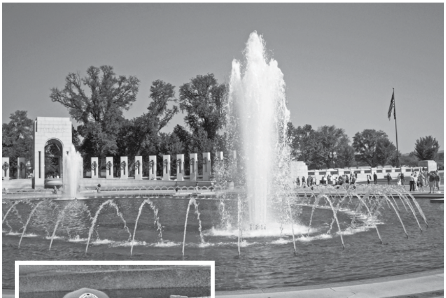
▲ World War II monument