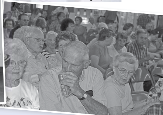
About 325 filled the air conditioned Extension Center.