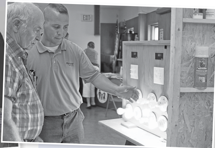
Members could see the difference between different light bulbs in the PPI's Wall Display.