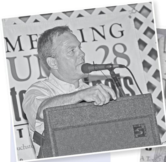
Adams Electric General Manager spoke to the crowd about the benefits of combining AEC and WIEC.

Every month we are printing four member's map location numbers in the newsletter. If you find your map location number call the WIEC office by the 25th of the following month, tell us where it is and we will give you a $10.00 bill credit. Keep on reading the WIEC News.