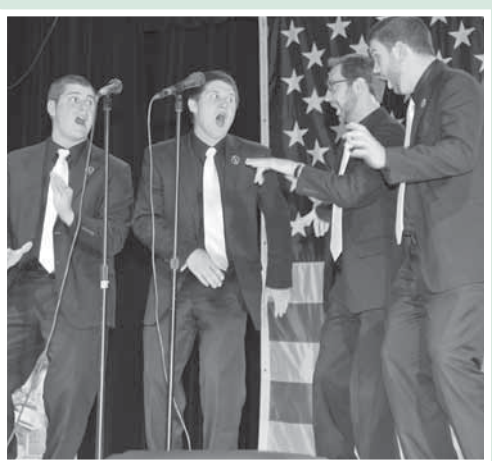
The "After Hours" barbershop quartet entertained the crowd with several songs prior to the start of the Annual Meeting.