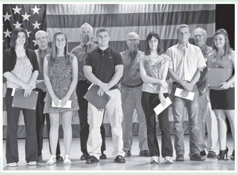
Several high school seniors in the Cooperative's service territory won college scholarships at the Annual Meeting.