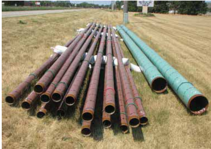
These natural gas pipes, which will be used in the expansion project, are positioned along Nazarene Drive in South Beloit.

The project involves digging a 3-foot trench and installing 10,000 feet of natural gas main, including 4-inch steel pipe that carries the high-pressure gas and 6-inch plastic pipe that delivers natural gas from a