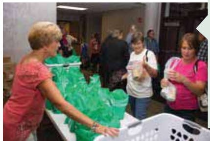
The 2014 Lite 4 Bite winner was Bethany Village Food Pantry in Anna. Over 800 cans of food were donated by nearly 200 members. In exchange for canned goods, the co-op gave away free, energy efficient CFLs.

Over 70 kids registered for a chance to win prizes. Twelve Toys R Us gift cards were given away to kids 12 and under. Everyone had a chance to see CFL Charlie.