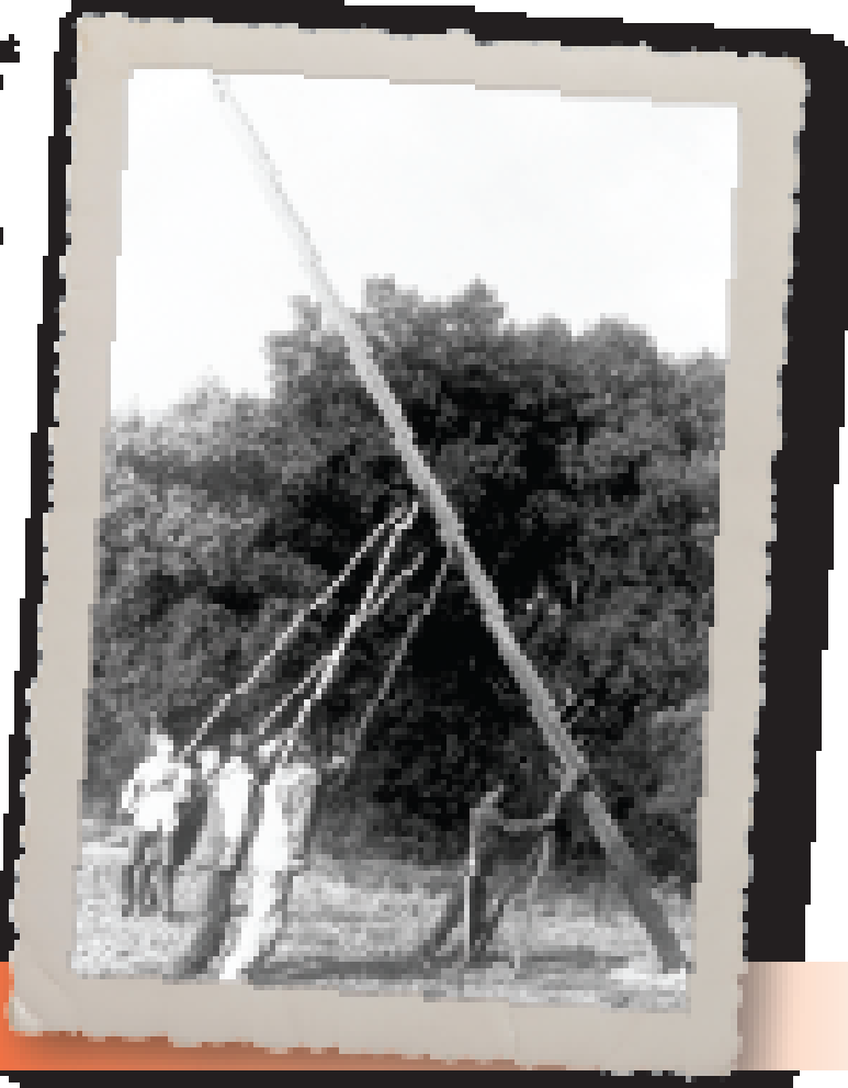
In the early days of electric co-ops, everything—even raising utility poles—was done by hand.

There are many ways to get the most out of your service. We're using the most advanced technology available. We're using the most advanced technology available.