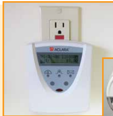
Optional In-Home Display