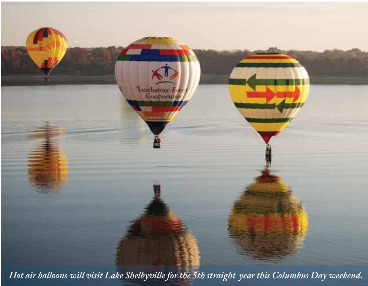
Hot air balloons will visit Lake Shelbyville for the 5th straight year this Columbus Day weekend.

Touchstone Energy Hot Air Balloonfest on Lake Shelbyville October 10th – 12th