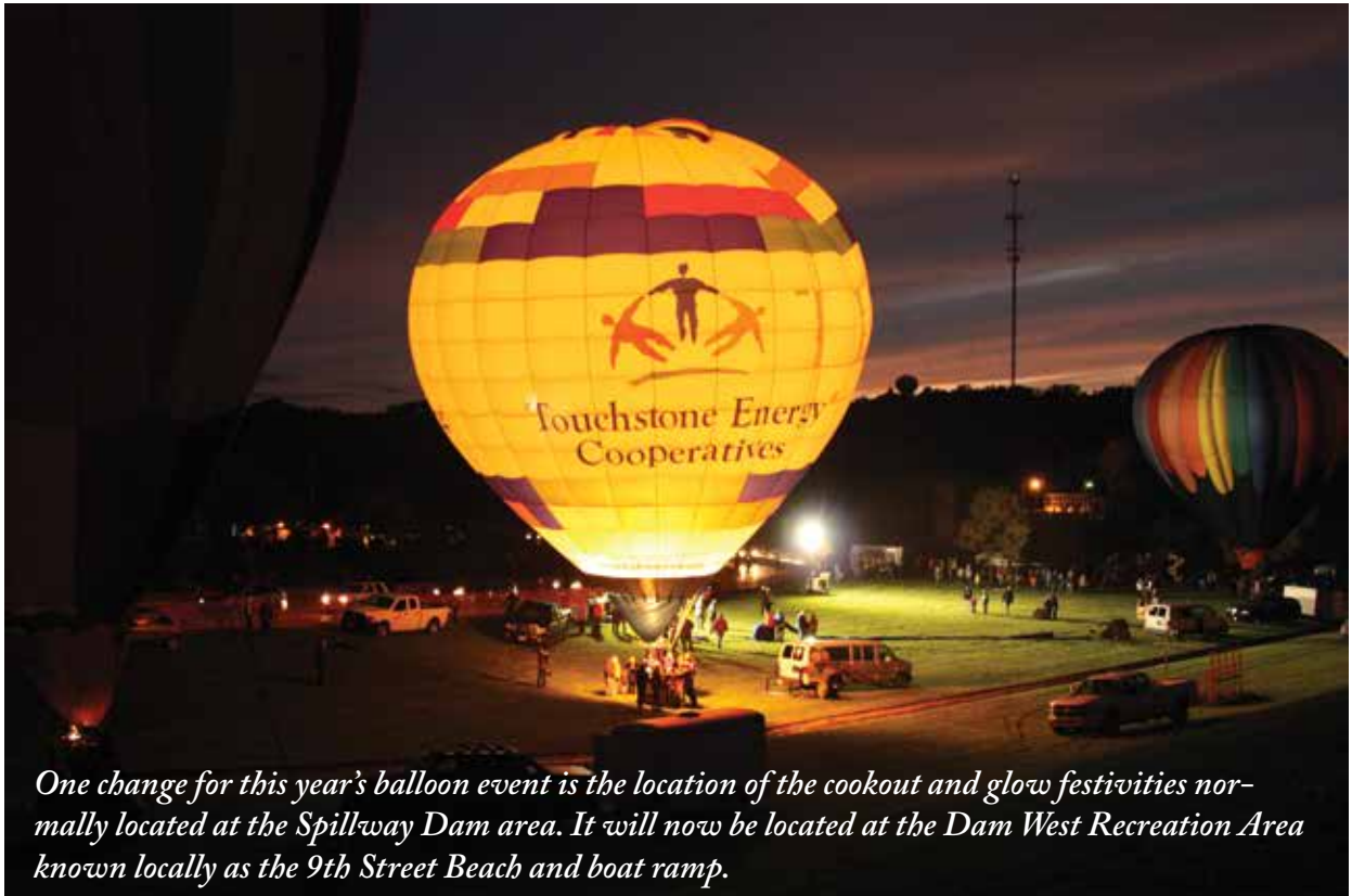
One change for this year's balloon event is the location of the cookout and glow festivities normally located at the Spillway Dam area. It will now be located at the Dam West Recreation Area known locally as the 9th Street Beach and boat ramp.

Touchstone Energy Hot Air Balloonfest on Lake Shelbyville October 11th – 13th