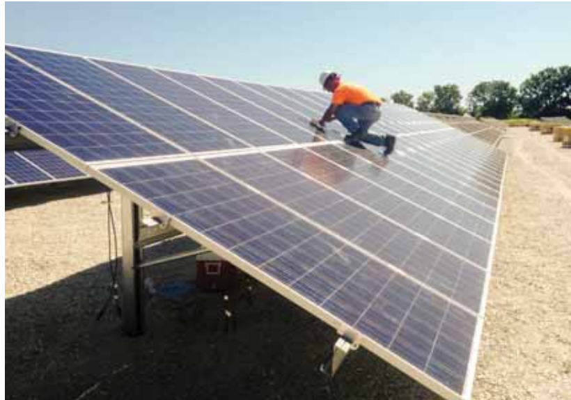
The Prairie Power, Inc. owned Shelby Solar Farm became operational in the fall of 2015.

Under Bright Options Solar, a member agrees to purchase blocks of solar-generated energy, at an added