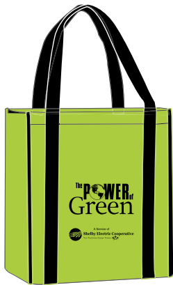
On July 20th at it's East Route 16 location, Shelby Electric Cooperative will be giving away a Power of Green recycling bag to the first 150 cars in to recycle.

The Power of Green recycling center is located at Shelby Electric's building on East Route 16, which is home to PWR-net, Shelby Electric's wireless broadband Internet.