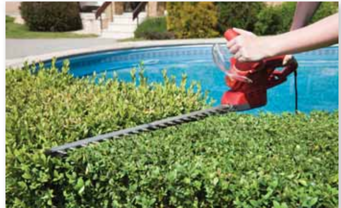
Use extreme caution when using electrical appliances outdoors, and make sure the outlet has ground fault circuit interrupter (GFCI) protection to prevent shocks.