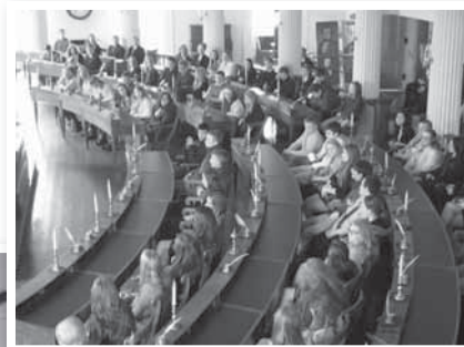
Students learn about the historic Old Capitol.