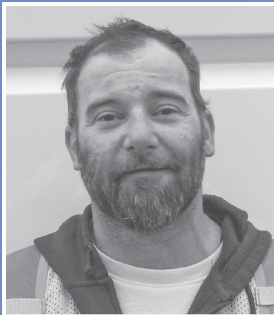
Pat Ballard Line Clearance Trimmer