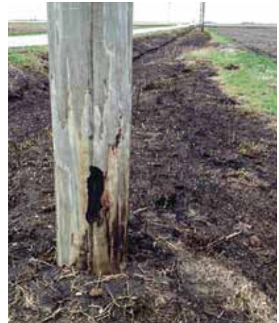
Controlled burns can damage the integrity of the utility pole.

We ask all of our members to please use caution during controlled burns or when using ditches to burn yard waste and limbs. If you are burning off ditches, please stay on the scene and watch them closely. Spraying water on the base of the pole while you are burning can help, but damage can still occur. Help us reduce the nuisance of outages and our costs to replace damaged poles; but most importantly, keep everyone safe. If you ever see this happening or notice damaged poles, please contact the office immediately, so we can look into the situation. We appreciate your understanding and help.