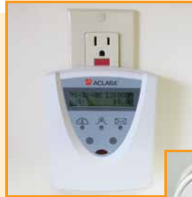
Optional In-Home Display