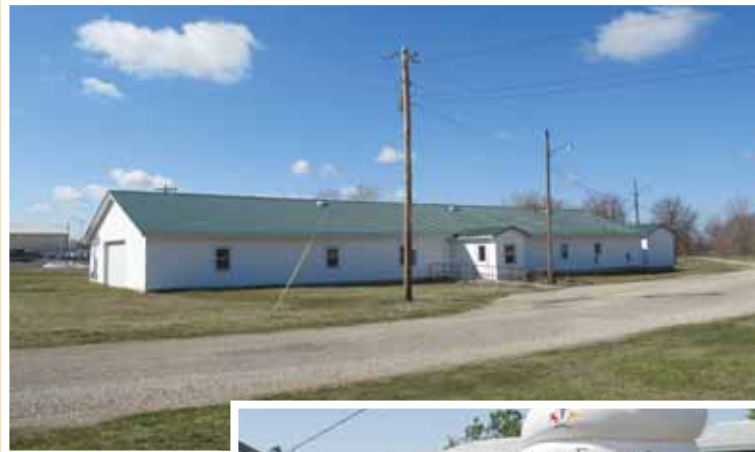
▲ The business meeting will once again be held inside the 4-H Center at the fairgrounds off of North Route 128.

Hope to see you Friday, June 13, 2014 at the 4-H Fairgrounds in Shelbyville for your Annual Meeting.