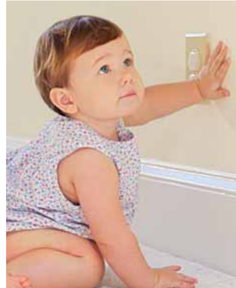
Young children often play around outlets. If your home isn't equipped with tamper resistant receptacles, make sure they at least have safety caps on them.

For more information on TRRS, visit www.esfi.org .