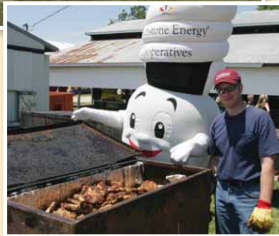
Come enjoy a pork chop dinner. ▶