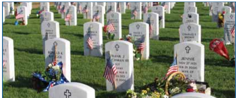
Cooperative offices will be closed on Monday, May 26th in observance of Memorial Day.