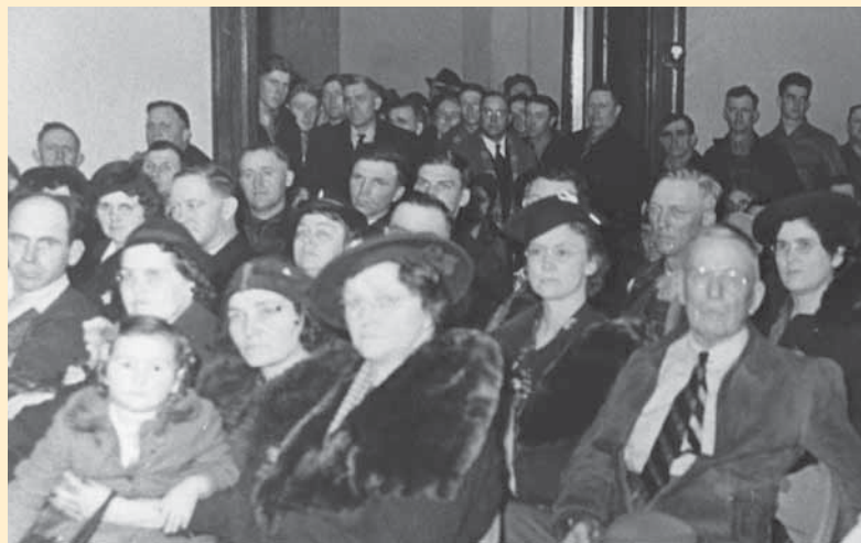
This photo was taken at the Cooperative’s first annual meeting in Shelbyville in 1938. The meeting was held in the Shelby County Courthouse.

One of the most memorable remarks made at that time was from a Tennessee farmer giving witness at his rural church, “Brothers and sisters, I want to tell you this. The greatest thing on earth is to have the love of God in your heart, and the next greatest thing is to have electricity in your house.”