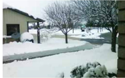
Looking out Marla's office window.

As the temperature outside increases, help the interior of your home stay cool. Shut blinds and window treatments on windows that face the sun. Use the microwave, slow cooker and grill for preparing food instead of the stovetop or oven. Use a clothesline instead of the dryer. Consider what the second refrigerator in the garage is worth to you. Refrigerators have to work harder, using more energy,