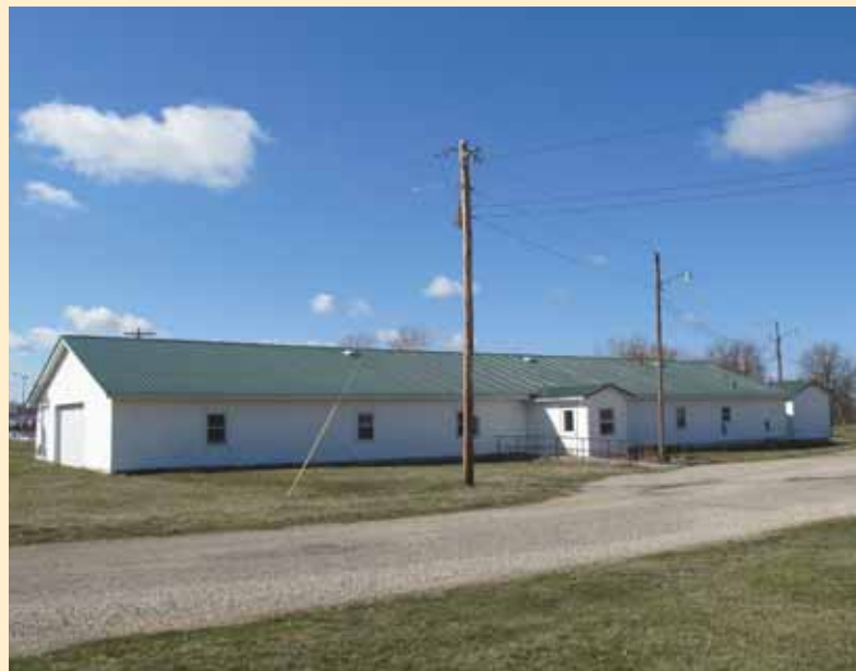
The business session will be held inside the 4-H Center at the fairgrounds off of Route 128 North.

These local pioneers wouldn't believe their eyes today. The coop-