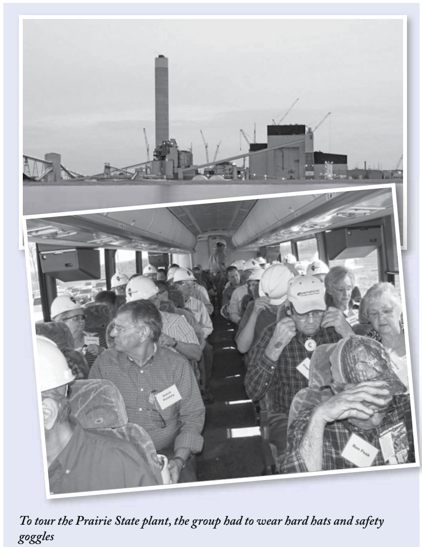
To tour the Prairie State plant, the group had to wear hard hats and safety goggles