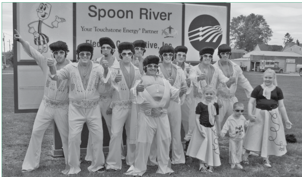
Employees of Spoon River Electric Cooperative and subsidiary business Spoon River Mechanical Services donned Elvis costumes Sept. 18 for the Canton Friendship Festival parade, which had a “Legends of Rock” theme. Several children of employees joined the group in the parade.

is a member of Touchstone Energy® — an alliance of more than 700 local, consumer-owned electric utilities around the country. Spoon River Electric is committed to providing superior service based on four core principles: integrity, accountability, innovation and commitment to community. The co-op serves nearly 5,000 members over 1,249 miles of line in parts of Fulton, Knox, McDonough, Peoria and Schuyler counties. For more information visit www.srecoop.org .