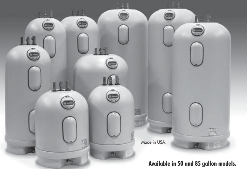
Available in 50 and 85 gallon models.