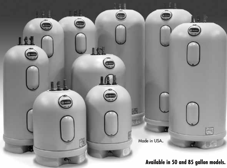
Made in USA.