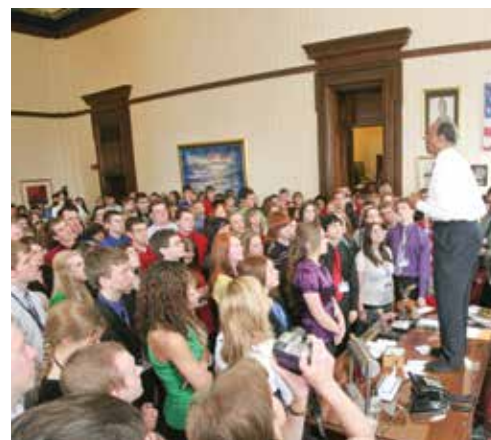
Secretary of State Jesse White meets with "Youth Day" students in his office.

Throughout the day, I am mindful that, as a Touchstone Energy Cooperative, we are committed to the communities we serve. I enjoyed meeting these teenagers and watching them take interest in our cooperative and their state government. "My" kids humor me while I make