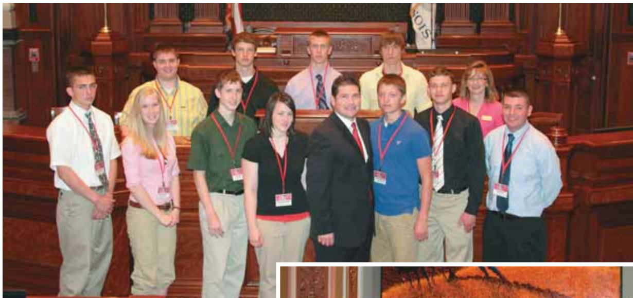
Students pictured with State Senator Kyle McCarter.