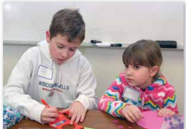
Children work on crafts while their parents attend the meeting.