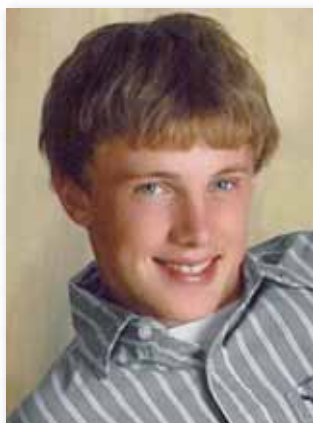
Donovan Nelson Edgerton High School