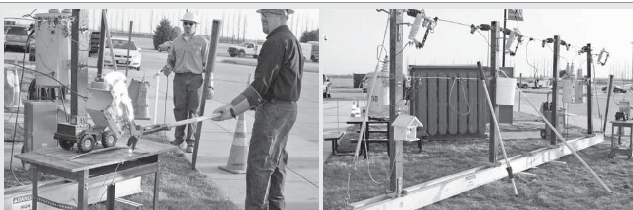
2010 Annual Meeting Safety Demonstration