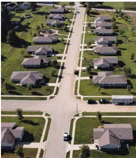
Phase 1 was completed in 2015