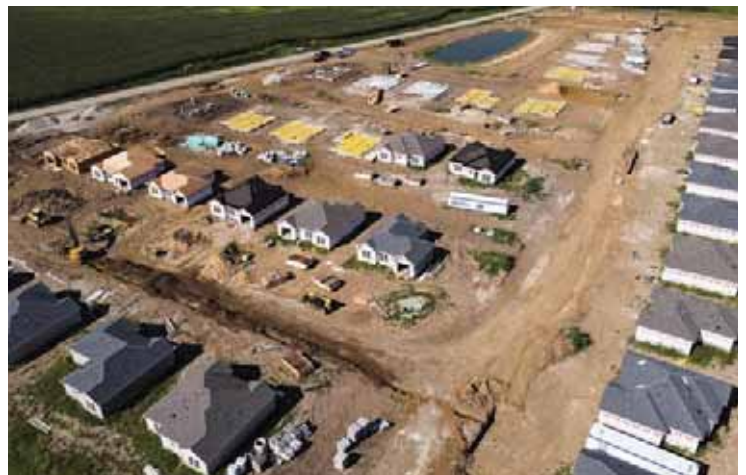
Phase 2 is scheduled for completion in 2023

Phase 2 of the Hathaway Homes project is underway. When its construction is complete, forty-eight more homes will be added to the Taylorville subdivision. Phase 1 of the project was completed in 2015 and consisted of twenty new homes. When completed, all sixty-eight homes will be served by the cooperative.