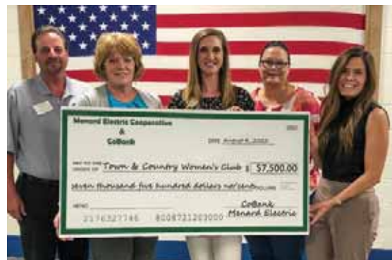
Town and Country Women's Club (TCWC)