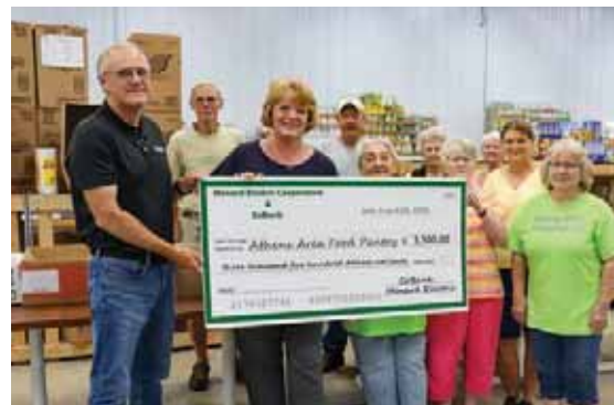
Athens Area Food Pantry

"The continued dedication of this group of volunteers to fill a need in their community is admirable, and we are pleased to support this program, particularly as food costs have continued to rise this summer," says Anker.