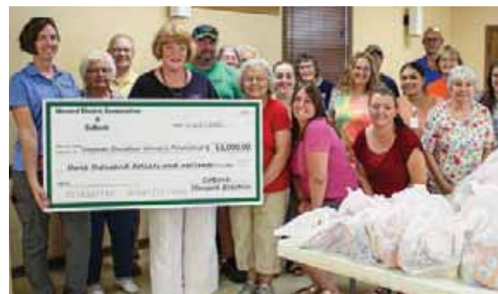
Virginia Christian Women's Fellowship