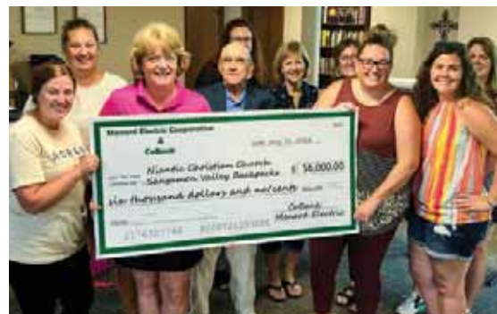
Niantic Christian Church's Sangamon Valley Backpack Program