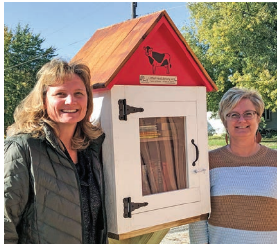
Middletown: At the town hall on the corner of Clinton and 7th Streets