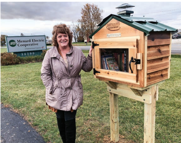
Petersburg: At our office on 14300 IL State Hwy 97