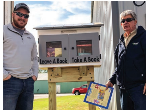
New Holland: Across from the town hall on Lincoln Street beside the community bulletin board.