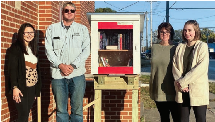
Oakford: At the town hall on 100 W Center Street

Installed in October the boxes have already seen good use by all ages, and we hope that continues for years to come. There’s no better time to look for a Little Free Library near you to chase away cabin fever this winter. Locate the boxes we’ve built or visit the website littlefreelibrary.org to view a map and find a library near you.