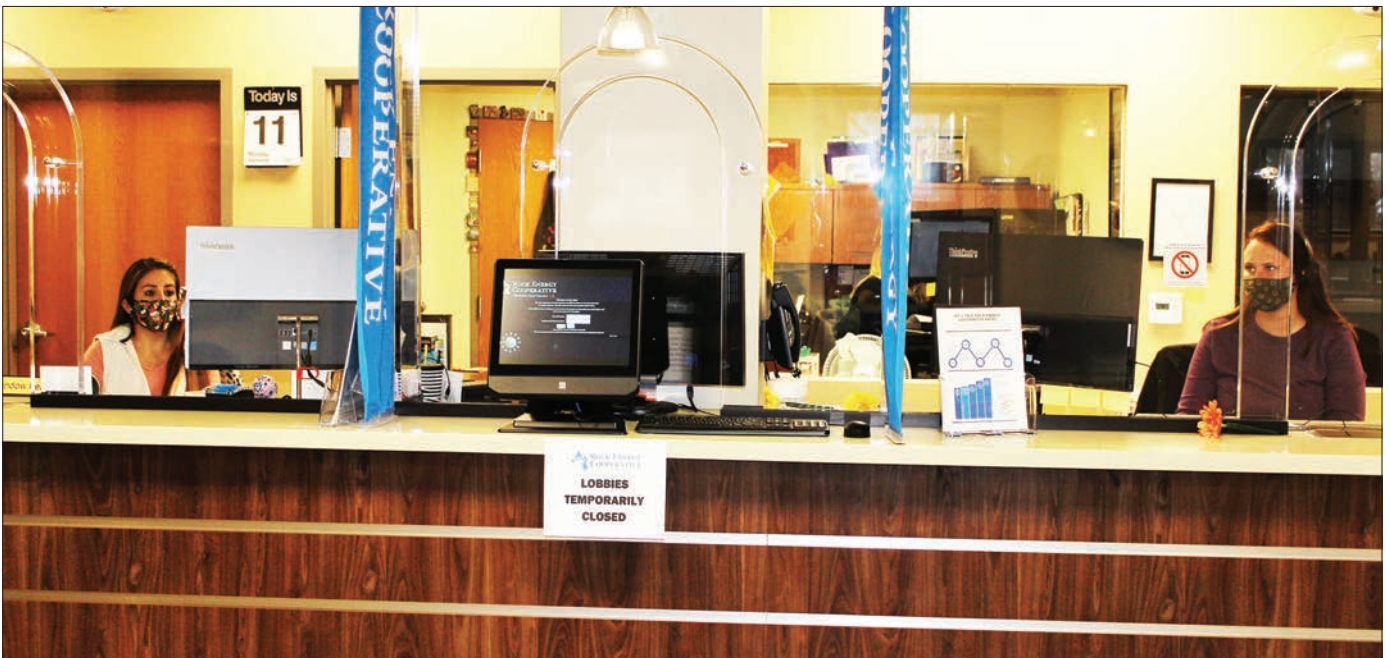
The lobbies at Rock Energy's Janesville and South Beloit offices are currently closed to members; however, member service representatives are available by phone during regular business hours.