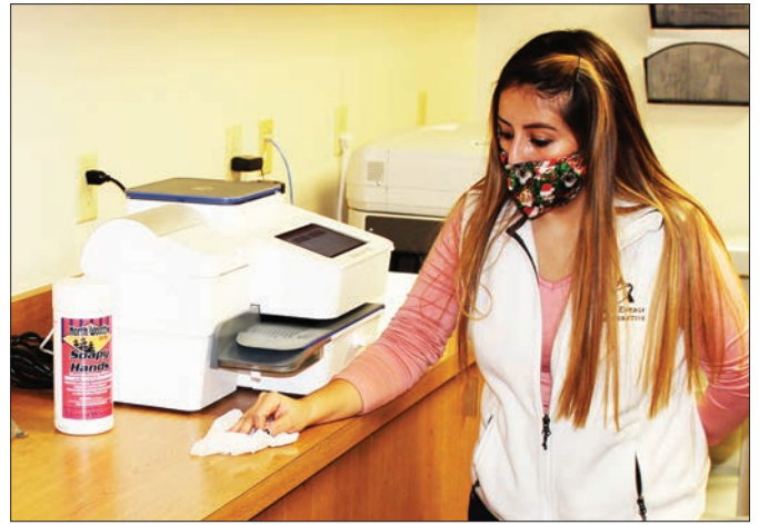
Pictured above and below, Rock Energy employees ensure that workstations and all equipment, both inside the office and in the maintenance shop, are sanitized daily.

Rock Energy is built on the strength of our members, along with the commitment of our employees and board members. You can rest assured that our dedicated team remains steadfast in our commitment to you, our members, no matter what the circumstances are and without question.