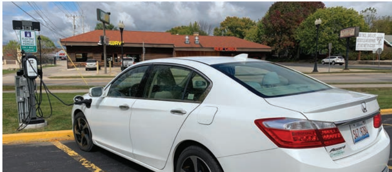
Jo-Carroll Energy's Honda Hybrid recharges at a co-op charging station at JCE's Savannah office. The charging station is now part of the regional co-op electric vehicle charging network, CHARGE EV.

"Our goal is to provide EV owners peace of mind driving from Iowa to northern Wisconsin or from Minnesota to Illinois, knowing there are co-op powered chargers along