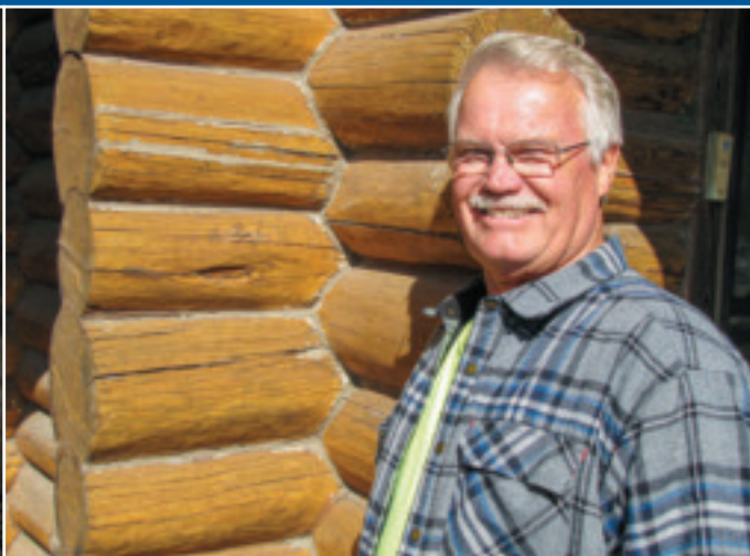
The log home was constructed in 1992 and included a Water Furnace HVAC system