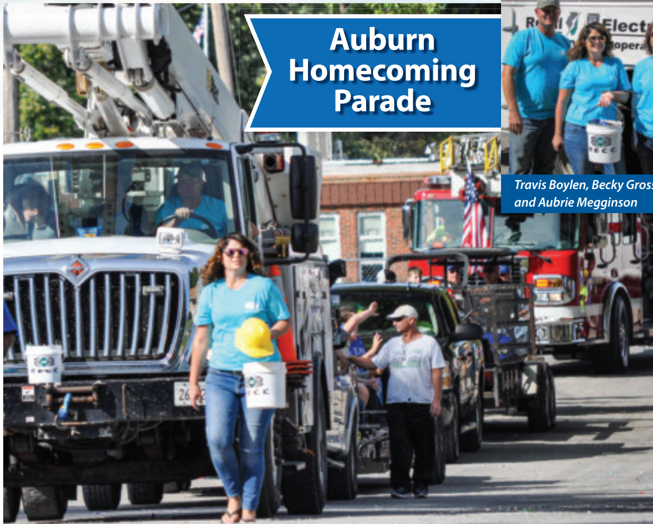
RECC participated in five parades in 2019 and we would like to thank each of those communities for welcoming us