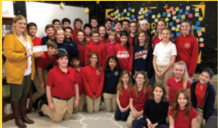
2018 recipient St. Andrew School, Murphysboro

An impartial panel of judges will review the grant applications based on the projects that best serve the purpose of improving the learning environment and/or increasing educational resources for the school. Past applicants and recipients may apply. Winners will be announced no later than Dec. 9, 2019.