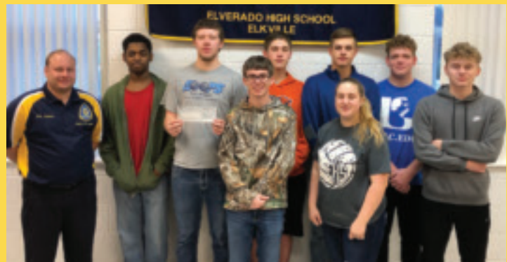
2018 recipient Elverado High School, Elkhart

Applications are due November 4. To learn more & apply, visit: www.eeca.coop .