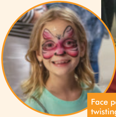
Face painting, balloon twisting and bucket truck rides are always family favorites.

Meeting was held June 13 at PORTA High School. More information on what was discussed during the business meeting can be found on our website at www.menard.com/82nd-annual-meeting-recap